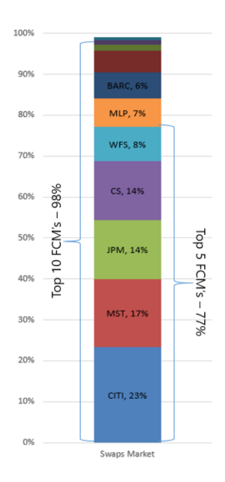
Graph 1 – FCM concentration by client assets